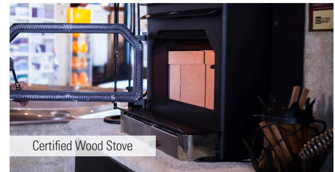
Certified Wood Stove