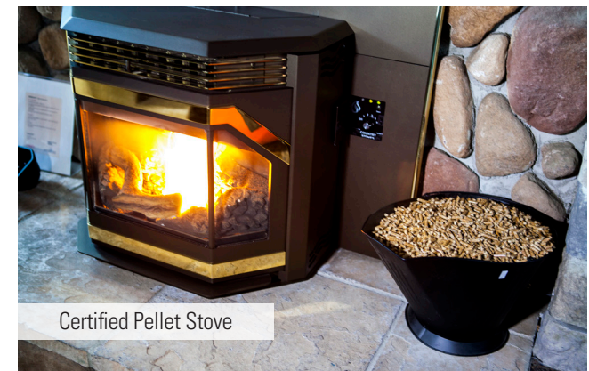
Certified Pellet Stove