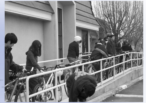
Visiting students line up their bikes outside the District office.

The 2005 calendar was distributed free to schools, community groups, health care facilities, churches, community-based organizations and individuals. To see the calendar artwork, go to www.valleyair.org and click on For Kids Only.