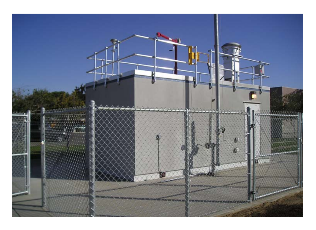
Modular building is anchored to the concrete pad