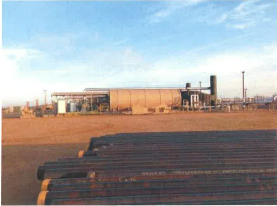
Photograph 3 View to the north from the southern edge of proposed Steam Generation Facility # 2 location.