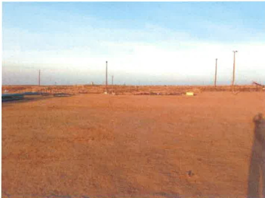
Photograph 4 View to the west from the eastern edge of proposed Steam Generation Facility # 2 location.