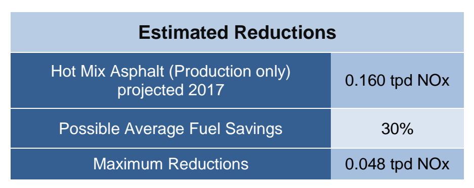
Table 1 Potential Emissions Reductions if all Valley Plants Changed all HMA to WMA

40%, with the average typically around 30%.<sup>9</sup> If every plant changed completely from HMA to WMA, there would be an estimated 0.048 tpd in NOx emissions reductions Valley-wide. This is a small potential emission reduction opportunity, especially considering the investments asphalt plants would have to incur to allow for the production of WMA at their plants.