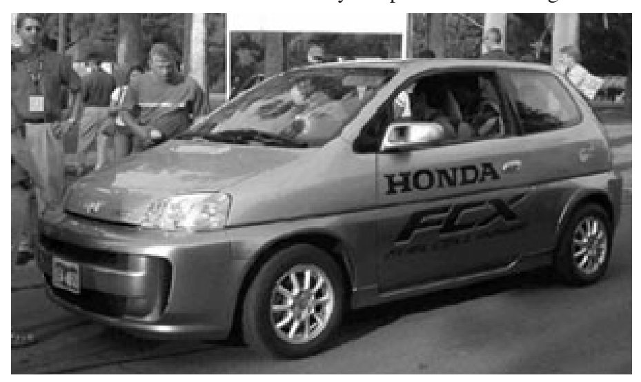
Those attending a Road Rally stop in Fresno check out the Honda FCX Hydrogen-powered fuel cell car.

Last year, the Bush administration announced a concerted effort to encourage auto makers to develop the alternative technology as a clean, renewable energy source that would reduce or eliminate the country's dependence on foreign oil.