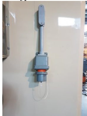
Trailer Box Entry