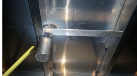
Weld-on uni-strut for roof mounting