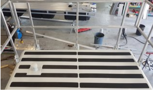
Roof with Railings and Anti-Slip