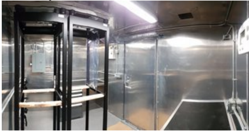
Above Rack Twist Lock Plug