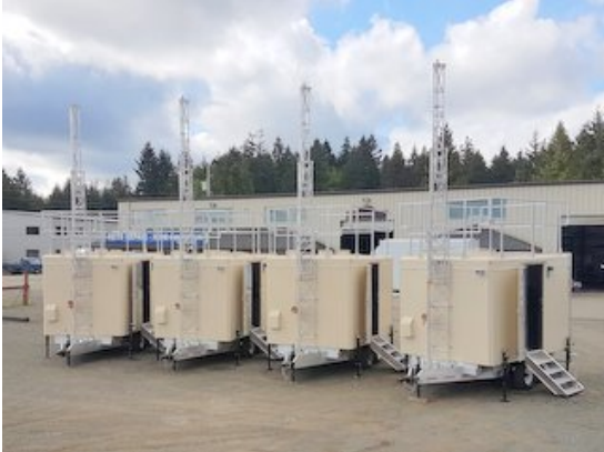
Example Trailer Mounted Nesting Towers