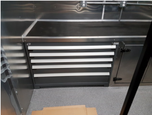
Example Counter tops and Toolboxes

Ancillary equipment (wheel chocks, fire extinguishers) will be provided as required. Counter tops will be constructed of aluminum framing with \frac{3}{4} " plywood underneath. Suggested surface is \frac{1}{8} " rubber material for electrical isolation and no slip work surface. Under counter tool boxes will be Rousseau type 4 drawer cabinets located as required. Wall cabinets as specified will be of similar construction as the tool boxes and mounted as per specifications.