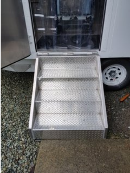
Example Doorway entrance stairway

Access stairways will be provided for the side entry of the enclosure. They will be of aluminum construction and hinge mechanisms will be integrated into the enclosure framing to allow for tilt up storage or removal.