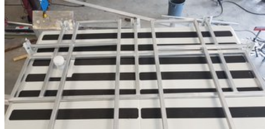
Folded Railing system for Transport