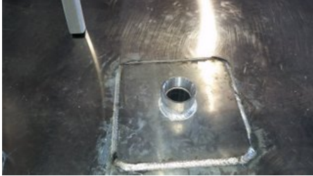
Box type Roof Entry Points